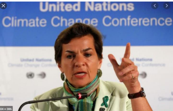
from Christina Figueres' new book